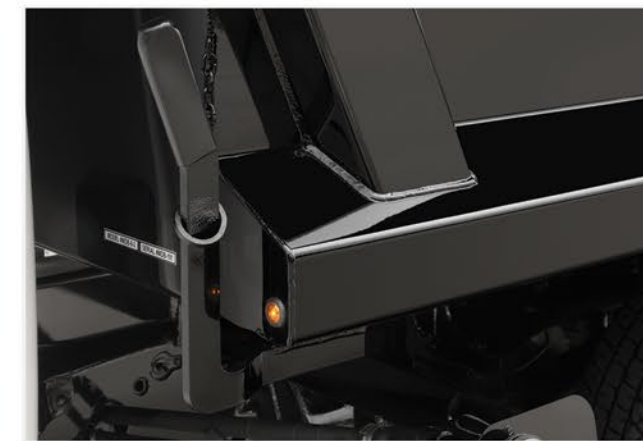
Single, and separate rubber-coated drop and swing-gate handles make it easy for one-person to release and re-secure the dump gate.