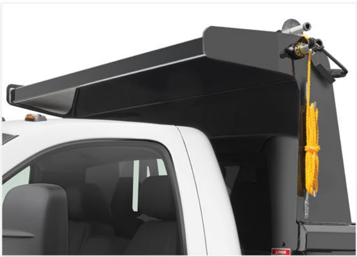
Morgan's optional bulkhead-mounted Pull-Tarp is easy to use, easy to store, and meets D.O.T. mandates for load-securement.