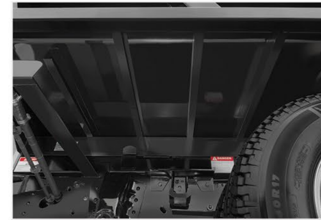
Welded steel construction, 5" structural channel longrails, and 3" crossmembers positioned 12-inches on-center, mean Morgan dump bodies are designed and BUILT to deliver the strength and durability you WILL depend on.