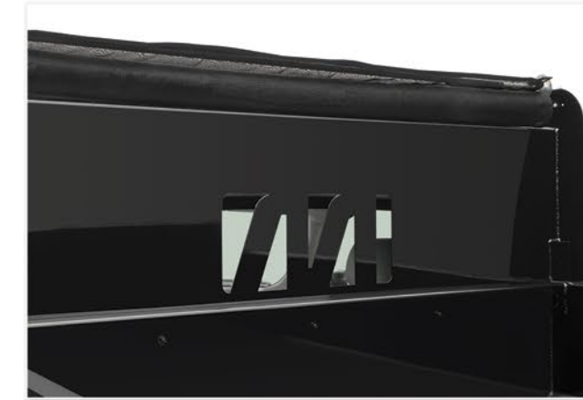
Morgan's heavy-duty steel bulkhead construction helps to protect cab and crew, while the innovative "M" pattern window supports greater visibility to the side and rear.