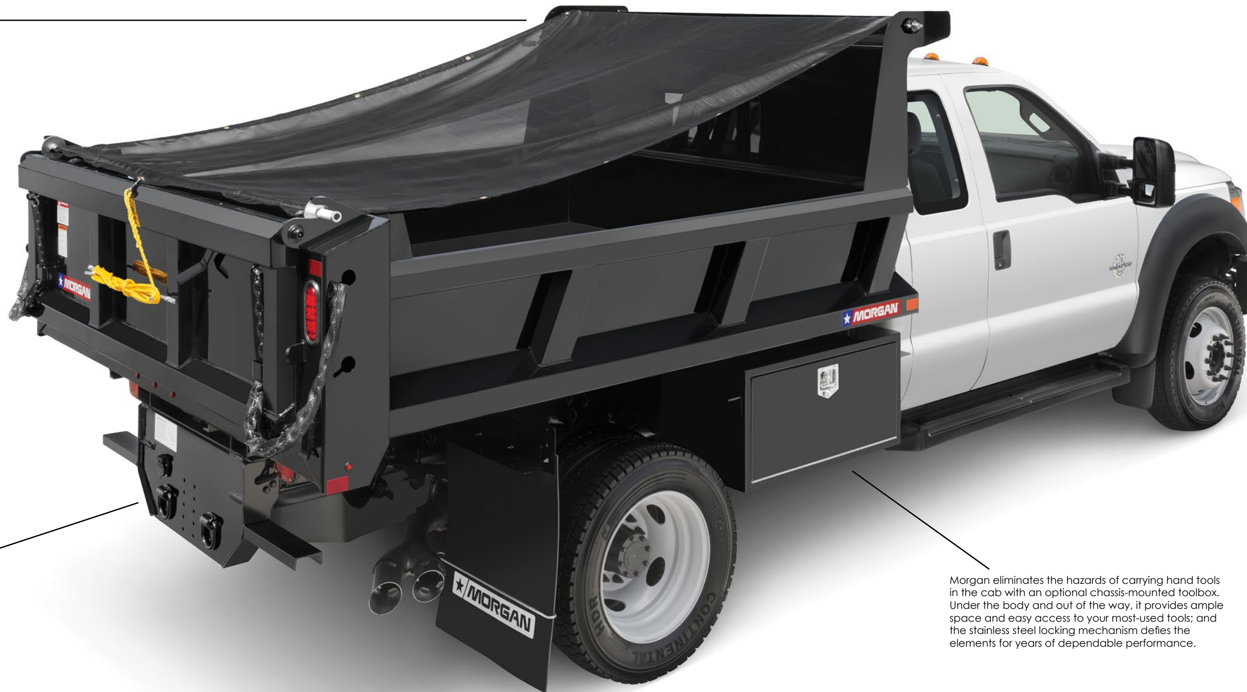
Morgan's heavy-duty hitch plate and tow rings make it easy to mount any hitch configuration and safely tow.