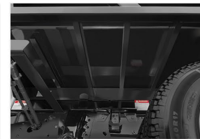
Welded steel construction, 5" structural channel longrails, and 3" crossmembers positioned 12-inches on-center, mean Morgan dump bodies are designed and BUILT to deliver the strength and durability you WILL depend on.