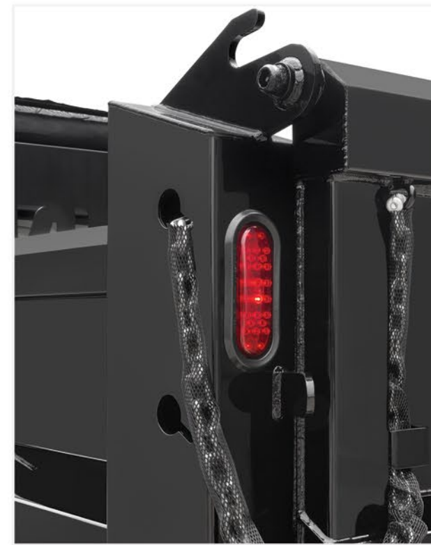
Heavy-duty mesh chain covers and redundant recessed lighting enhance safety.

Welded steel assembly, 17" high 10-and-12-gauge double sidewalls, a 10-gauge steel floor, and a 23" 12-gauge steel dump/swing gate make a Morgan body tough-enough to handle whatever the job requires. That promise is backed by Morgan's 3 Year Warranty AND a reputation for innovative design and quality construction that spans over 60 years!