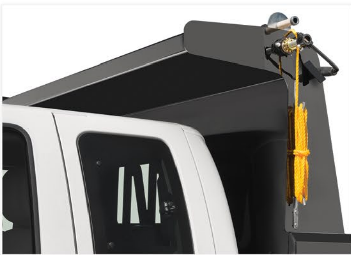
Morgan's optional bulkhead-mounted Pull-Tarp is easy to use, easy to store, and meets D.O.T. mandates for load-securement.

From the ability to accommodate a variety of hitch and hoist configurations, to your choice of features designed specifically to add ease and convenience to the work you do every day, Morgan options support greater productivity -- and THAT translates to a better bottom-line!