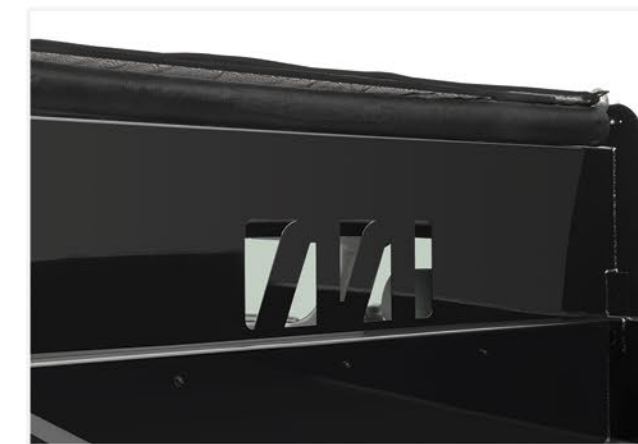
Morgan's heavy-duty steel bulkhead construction helps to protect cab and crew, while the innovative "M" pattern window supports greater visibility to the side and rear.