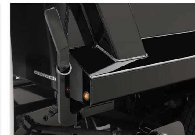
Single, and separate rubber-coated drop and swing-gate handles make it easy for one-person to release and re-secure the dump gate.