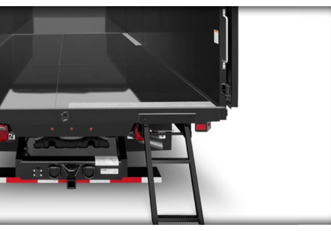
Stirrup steps at rear, roadside and curbside doors with anti-slip tape on floor for added traction