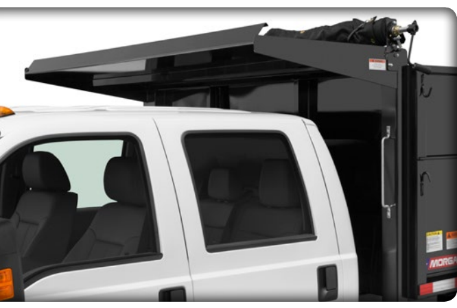
Front Bulkhead: 10GA. Sheet Steel with no window