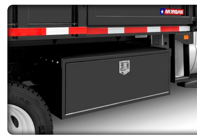
Tool box (sizes available may vary)