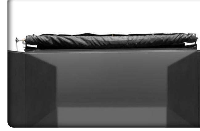
Manual mesh tarp with pull cord