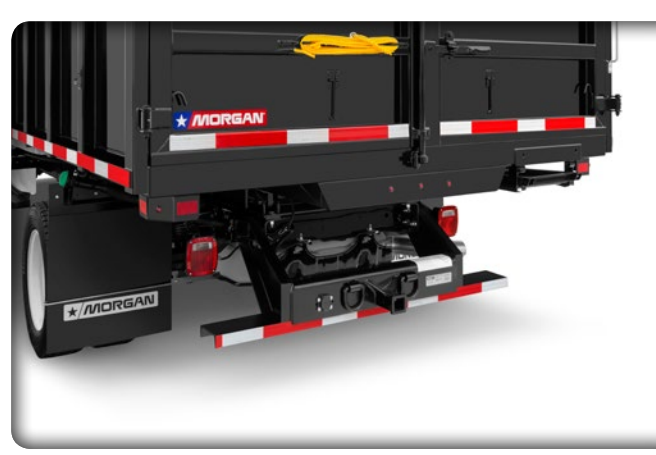
2" receiver tube style hit